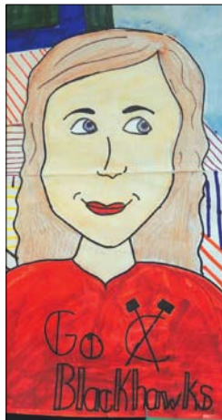
Student artwork at the opening.