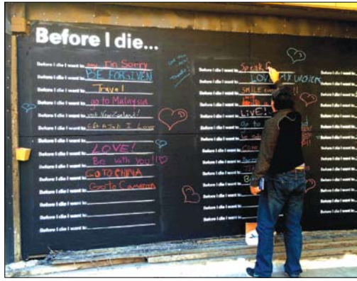
"Before I Die" blackboards have been created in over 70 countries.